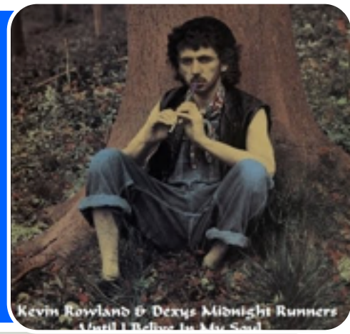
Kevin Rowland & Dexys Midnight Runners Until I Belong In My Soul